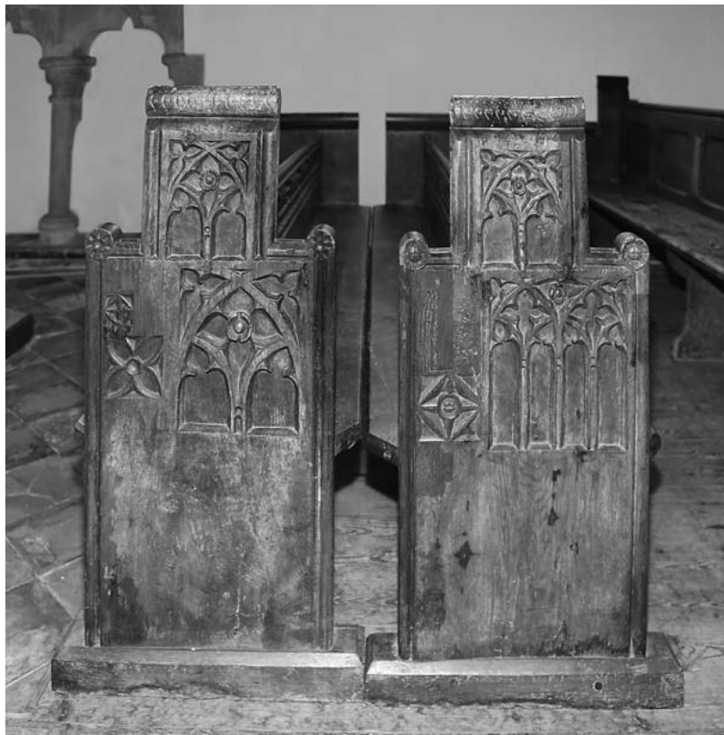
FIG. 115 – Decorated ends of two pews in Barrow church.

Church pews are currently the subject of much debate for the practical reason that many parishes wish to move or remove them in keeping with modern forms of worship. Part of their