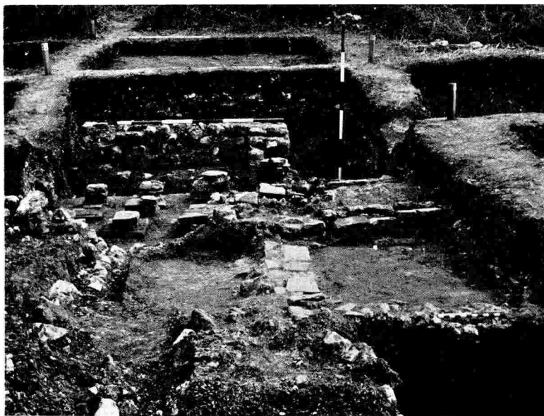
(b) The plunge baths, the west room and the wall of the cistern. The first waste pipe can be seen below the foot-rule.