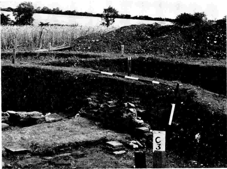
(b) East room showing cement floor and blocked flue.