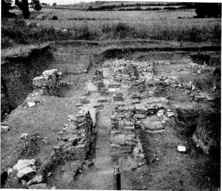
(a) General view. In the foreground the east flue with blocking wall removed.