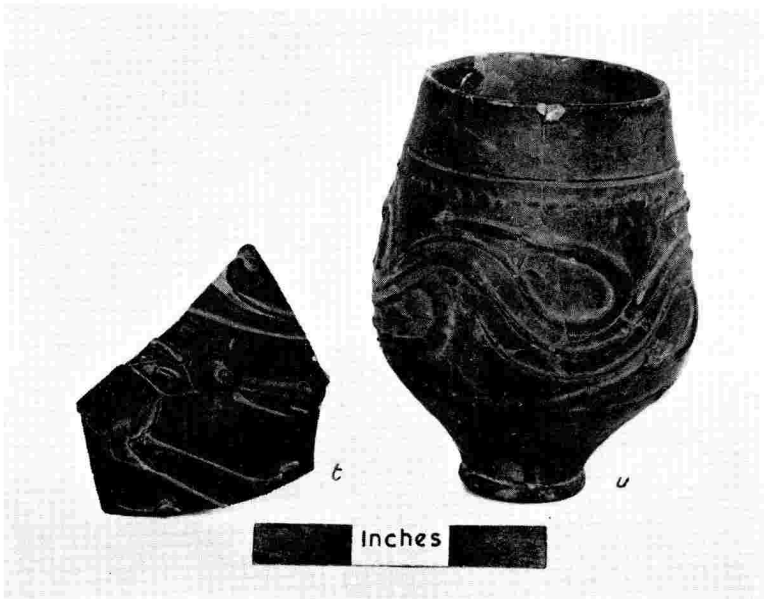
(b) Colour coated ware.