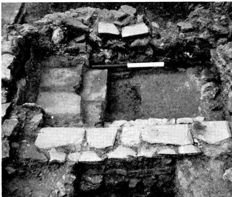
(a) West plunge bath looking west. On the right is the cement floor of the first stage, on the left, the tile floor and quarter-round mouldings of the second stage.