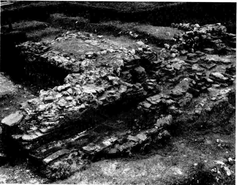
(b) West end showing north wall of flue and plunge baths with lead pipe in position.