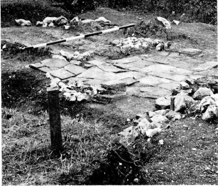
(a) Tile floor and footings of apsidal wall of east room after removal of flue.