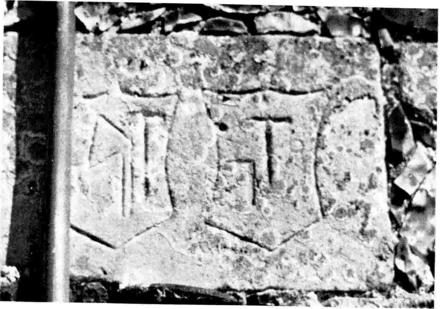
a , Uggeshall.