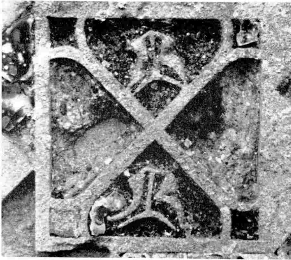
b , Walberswick. Suffolk Masons' Marks.