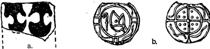
FIG. 74.—a, Fragment of window glass. Scale \frac{1}{4} . b, 'Boy-Bishop' token. Actual size.

1A. Part of a border-strip in fairly thick (2 mm), good-quality glass; perhaps soda, rather than potash, glass, but thicker than the fine 15th-century glass that was sometimes imported unpainted. Some pitting on the exterior, but the fract shows deeper denaturing on the interior. Neatly grozed to make a rectangle 4.5 cm wide. Colourless, but painted black to leave a clear cresting of a trefoil between 2 half-trefoils, cut off at their tops, perhaps the fleurs of a stylised crown. These borders belong generally with grisaille glass, having coloured figures or emblemata, and thus to the 14th or early 15th century, rather than later. Fig. 74, a.