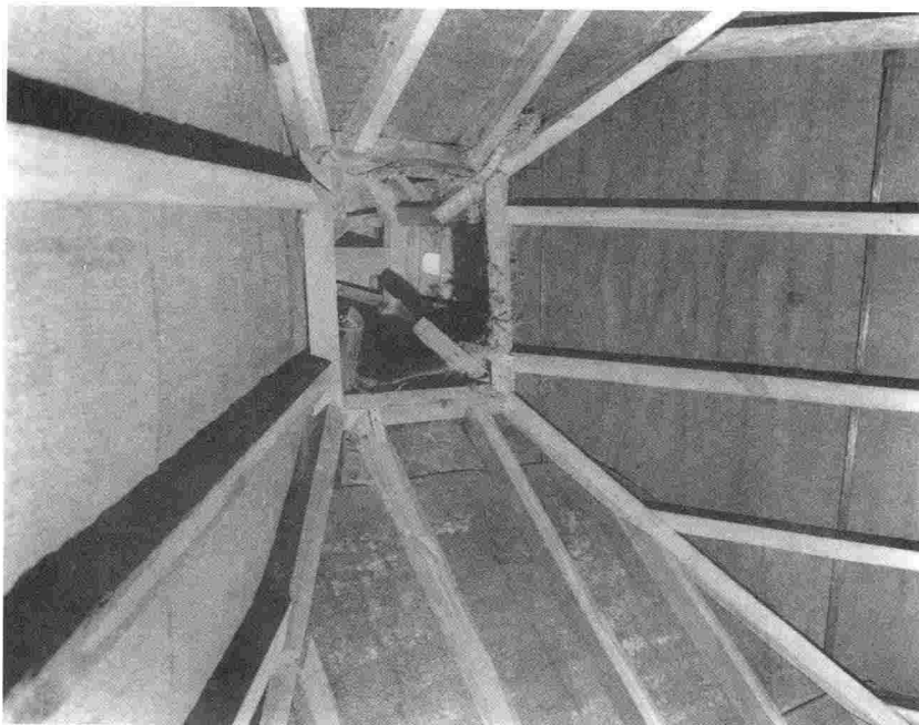
FIG. 128 – Looking up at the roof at Stoke Ash. The original hip rafters project into the square frame to prevent large birds of prey from penetrating to the interior. The octagonal louver itself has been renewed.