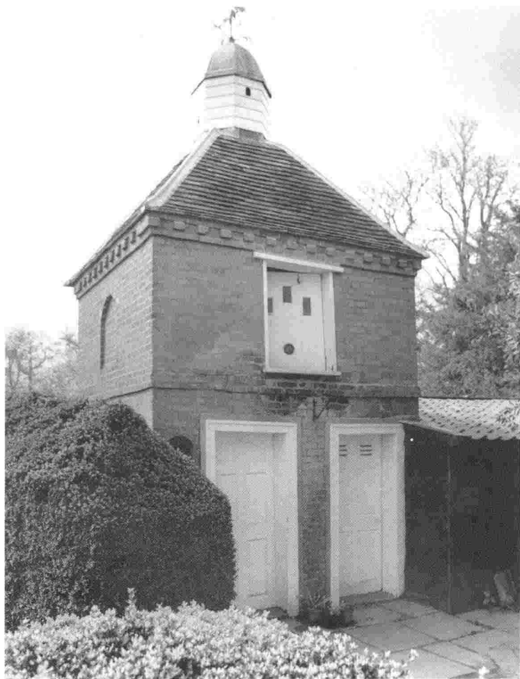
FIG. 126 – The dovecote at Stoke Ash from the east-south-east.