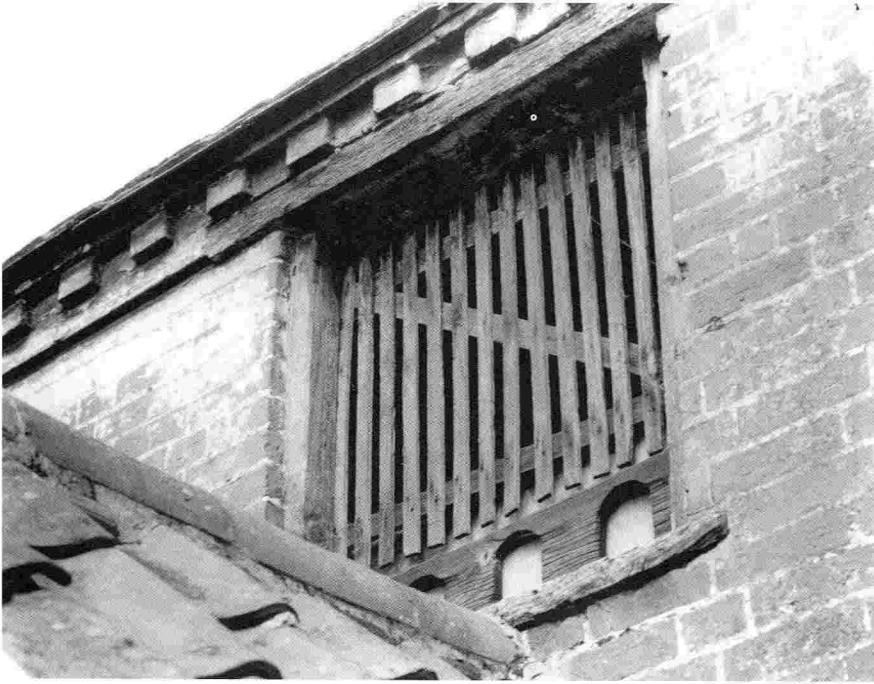
FIG. 130 – At Little Bealings this inserted aperture dates only from the introduction of the small-scale keeping of ornamental pigeons in the late 19th or early 20th century. Earlier the pigeons would have entered at a louver on the apex of the roof.