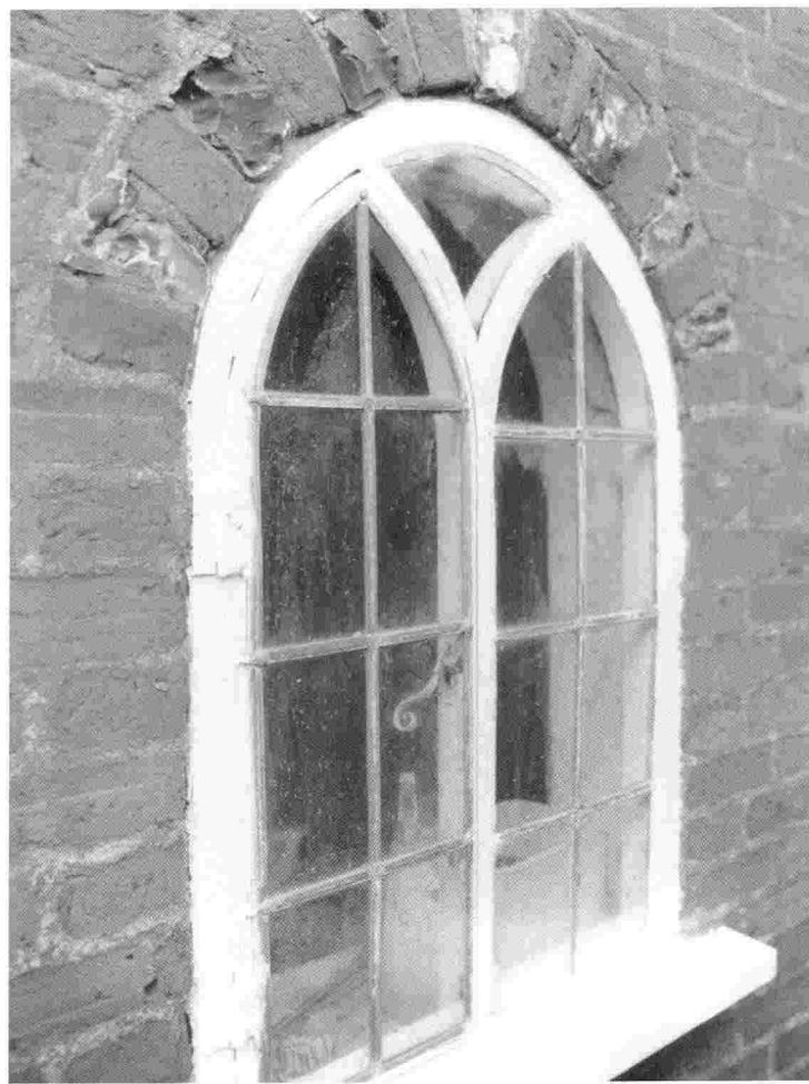
FIG. 127 – The ground-floor window at Stoke Ash.