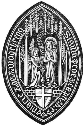
SEAL OF WOODBRIDGE PRIORY.